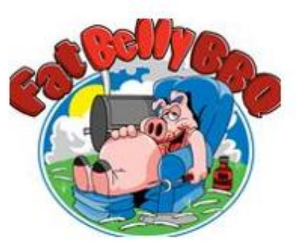
$25.00 / Per Person

Please Make Checks Payable to: St. Augustine Guild