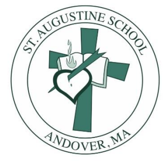
Sunday, December 12, 2021