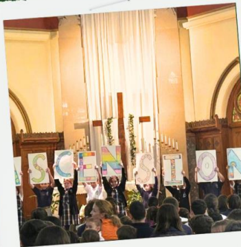
Happy Ascension from Grade 3!