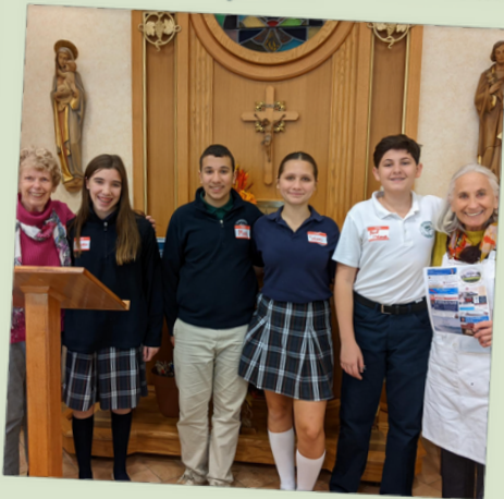
Campus Ministry student leaders served at the monthly Senior Luncheon held at the Parish Center!