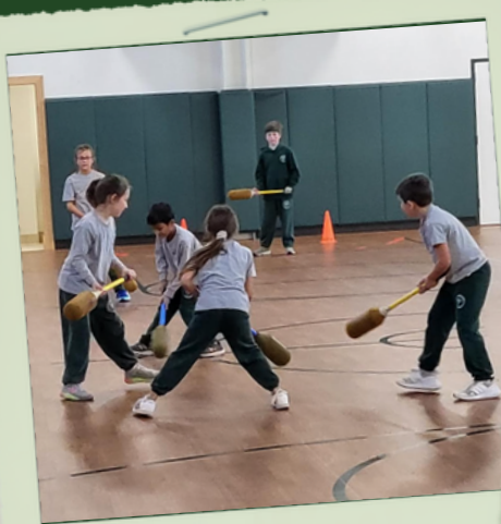
Fourth graders played "Pillow Polo" in Gym class last week!