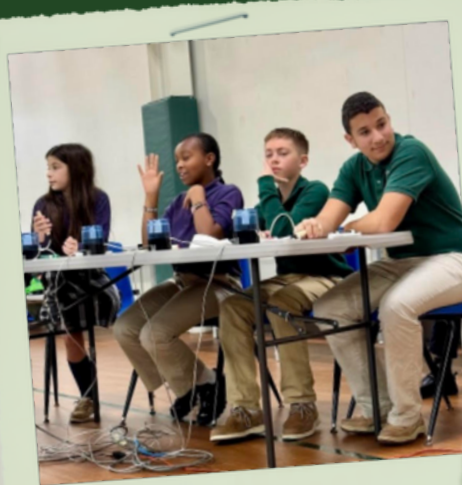
Students faced off against our faculty in trivia during the Turkey Bowl!