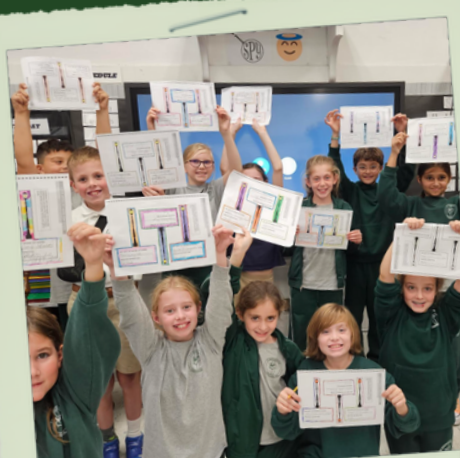
Fourth Graders colored lamps with prayer intentions for family and friends.