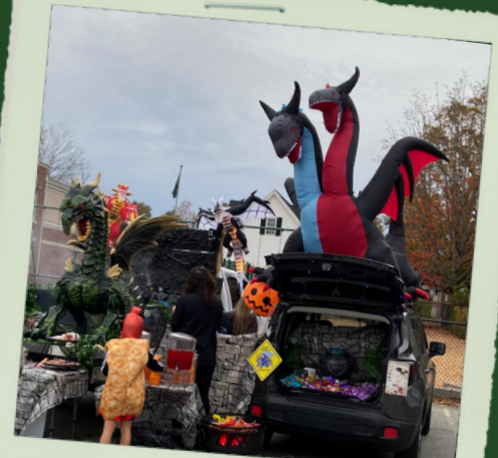
Trunk or Treat was a great time on Friday Night!