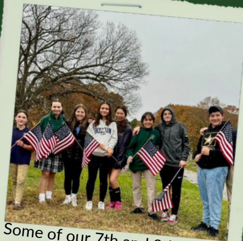
Some of our 7th and 8th graders braved the rain and helped change tattered flags on veterans' graves at the cemetery.