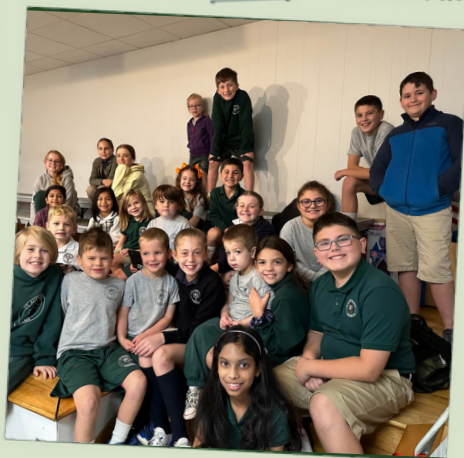
Our Morning Care students enjoy their Breakfast Club in the SAS cafeteria!