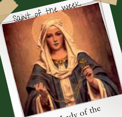
Our Lady of the Rosary