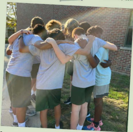
Our Cross Country Team joined together in prayer before their first meet of the season. The Boys' Team went on to win the meet!