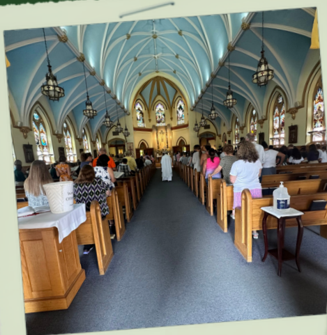
We celebrated our first school mass of the year on Wednesday.