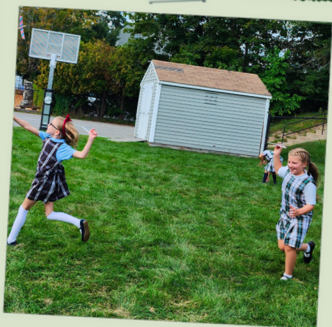
Third Graders built and flew airplanes this week.