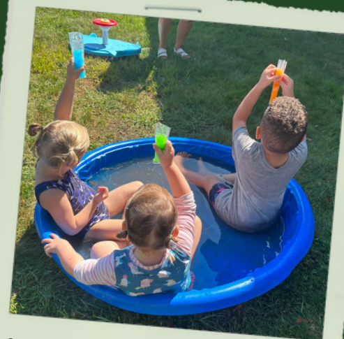
St. Julie's students enjoyed a "Beach Day" to escape the heat on Thursday.