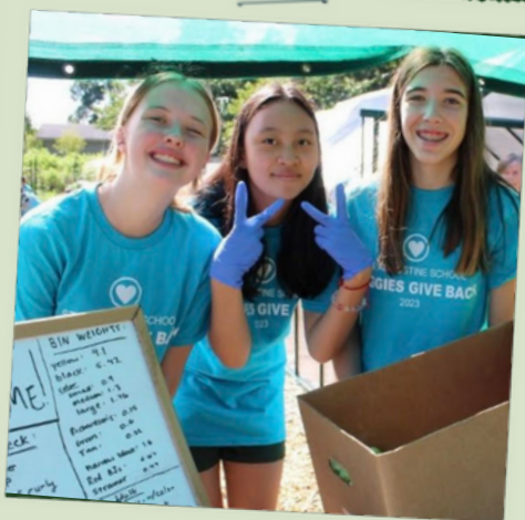
Middle School students gave back on Aggies Give Back Day!