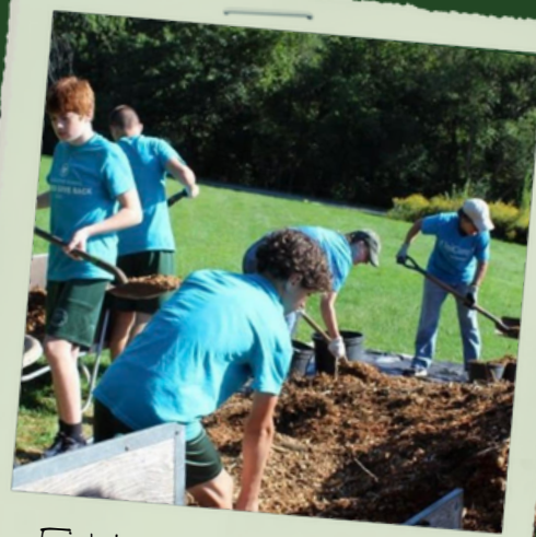
Eighth graders served at Ironstone Farms on Thursday!