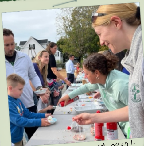
SAS families enjoyed great weather and had lots of fun at our Ice Cream Social Friday night!