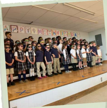
Kindergarten put on a beautiful Mother's Day performance!