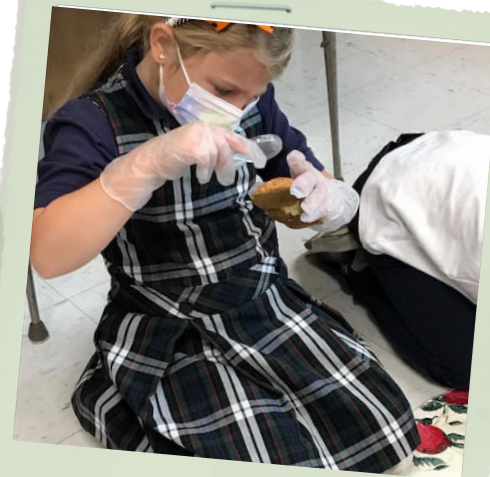
1st grade brings NATURE into the classroom!