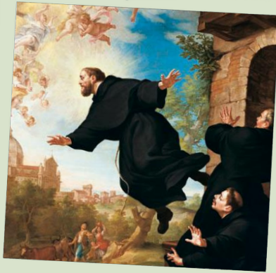
St. Joseph of Cupertino