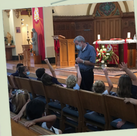
2nd Grade visits the Church!